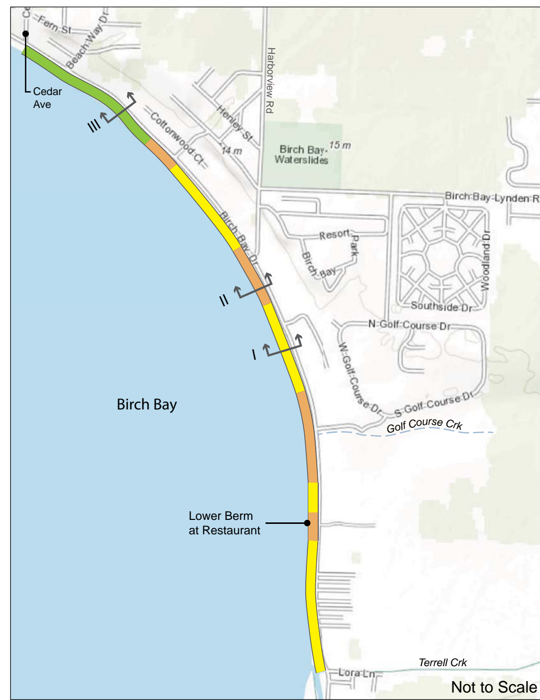
Map Showing Location of Path Types

* = Active Crest is frequently inundated by tide/waves