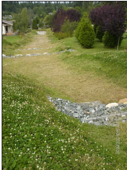
SILVER BEACH CREEK BIOINFILTRATION SWALE