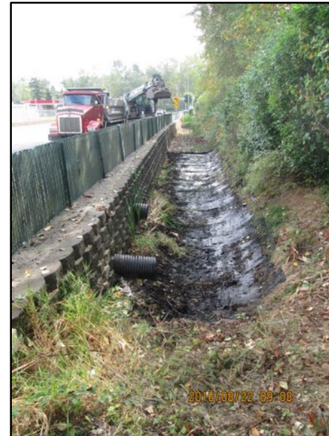
AIRPORT WAY/ BENNETT DRIVE RETENTION/ POND MAINTENANCE